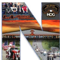
Maine HOG Rally July 13—16, 2016