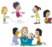
Activities Bowling March 20,