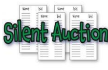
Silent Auction April 16, 2016